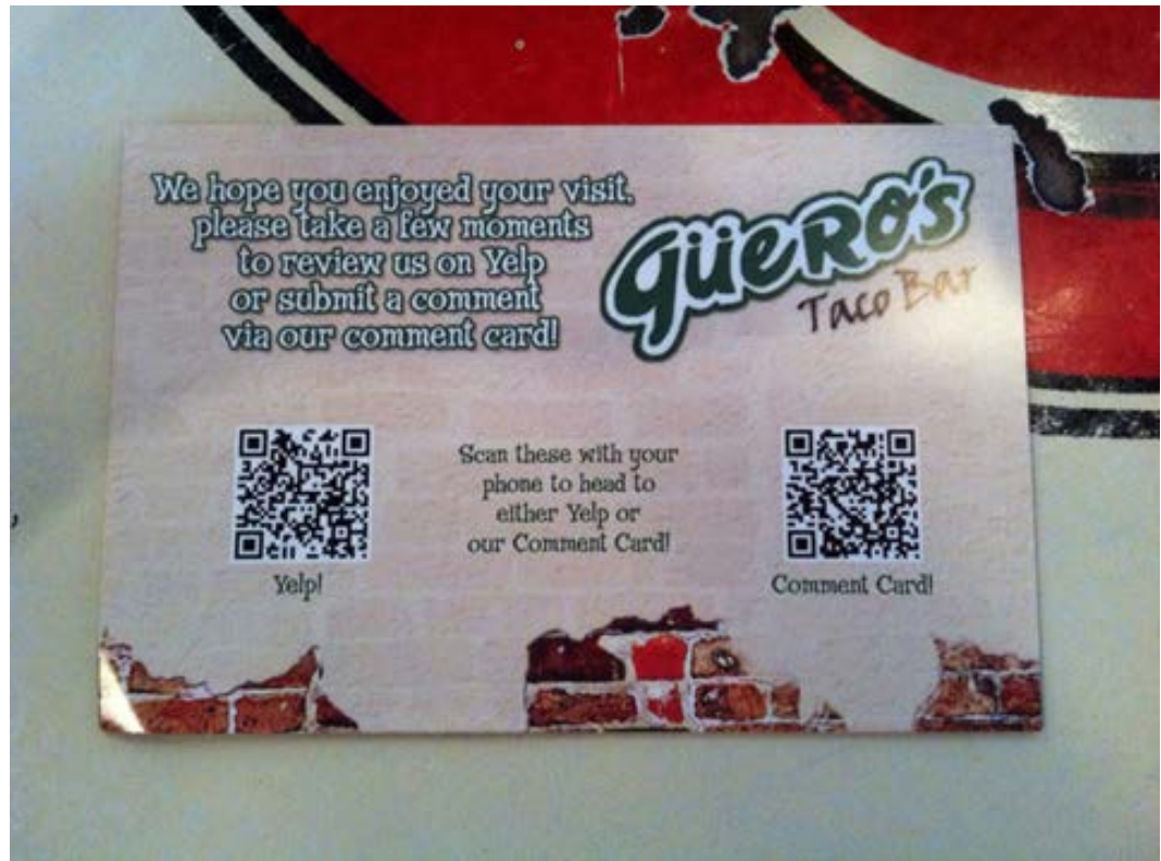
http://www.siznieas.com/114105/2012/09/25/new-york-ny-nyc-council-passes-bill-to-require-restaurants-to-post-qr-codes

Print a QR code on the receipt that links to a guest survey that customers can fill out when they get home. That's what Guemo's Taco Bar in Austin does.