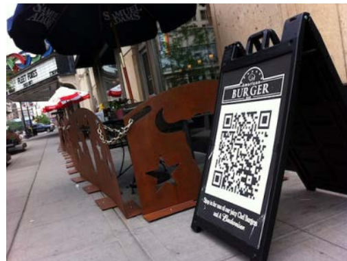
Image Credit: John Tlumacki of the Boston Globe http://www.siznieas.com/114105/2012/09/25/new-york-ny-council-passes-bill-to-require-restaurants-to-post-qr-codes