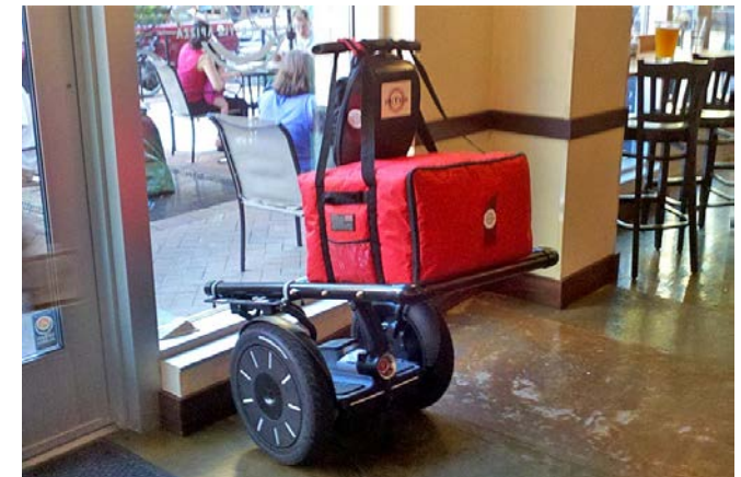
Image Credit: http://segwaynz.wordpress.com/2012/07/ http://www.arinow.com/2011/07/18/petes-to-begin-segway-pizza-delivery-tomorrow/